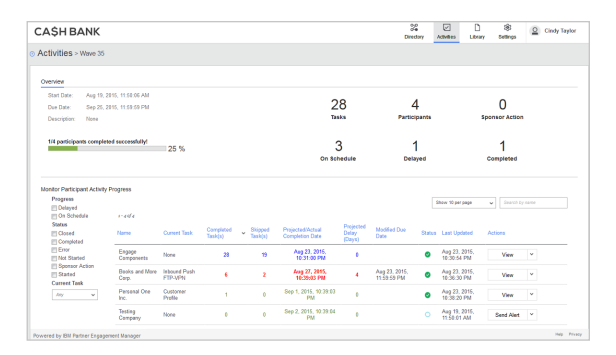
Efficient, automated onboarding and management of partners, suppliers and customers